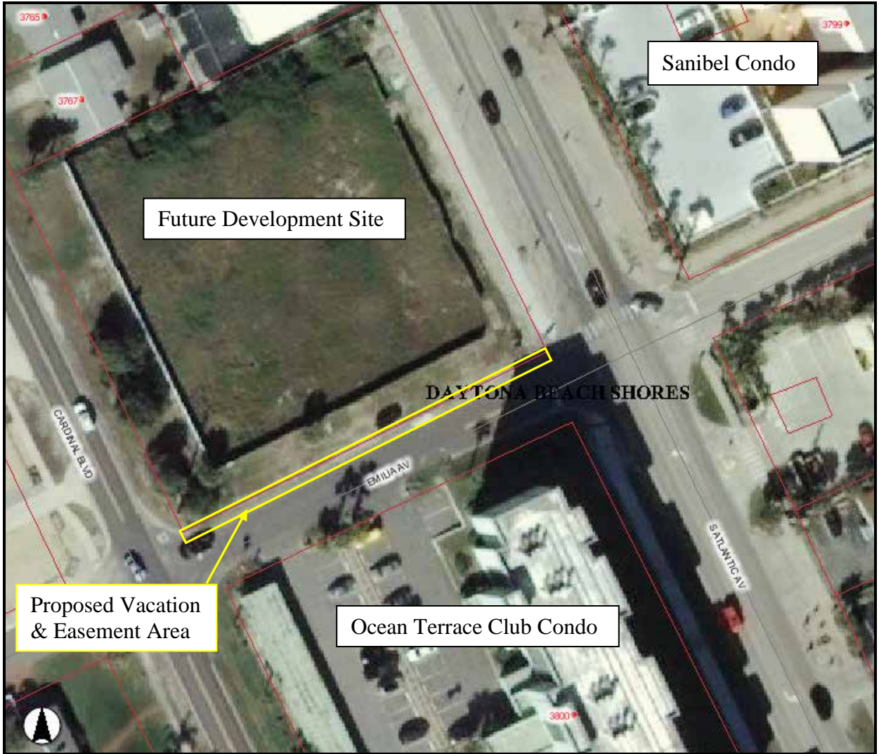
EXHIBIT 1 (Approximate Location of Vacation Area)